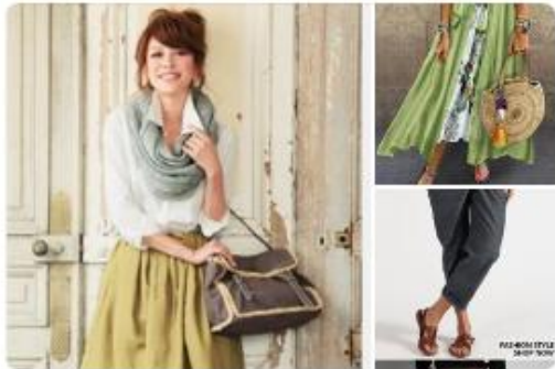
STYLE ME: CREATIVE ORIGI...