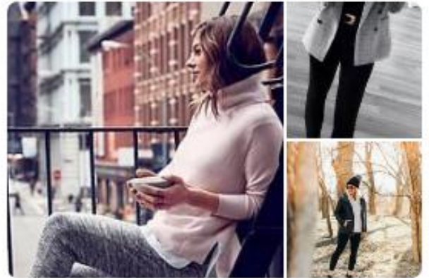
STYLE ME: ATHLEISURE

These pieces are almost always solids in neutrals, with the exception of stripes.